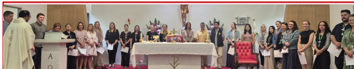
START OF SCHOOL YEAR AND STAFF COMMISSIONING MASS