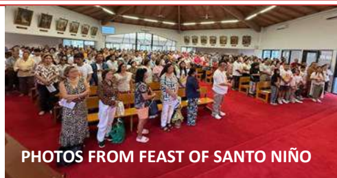
PHOTOS FROM FEAST OF SANTO NIÑO