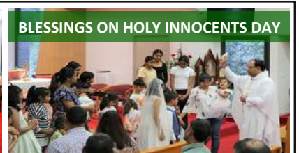
BLESSINGS ON HOLY INNOCENTS DAY