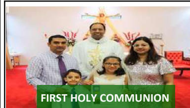
FIRST HOLY COMMUNION